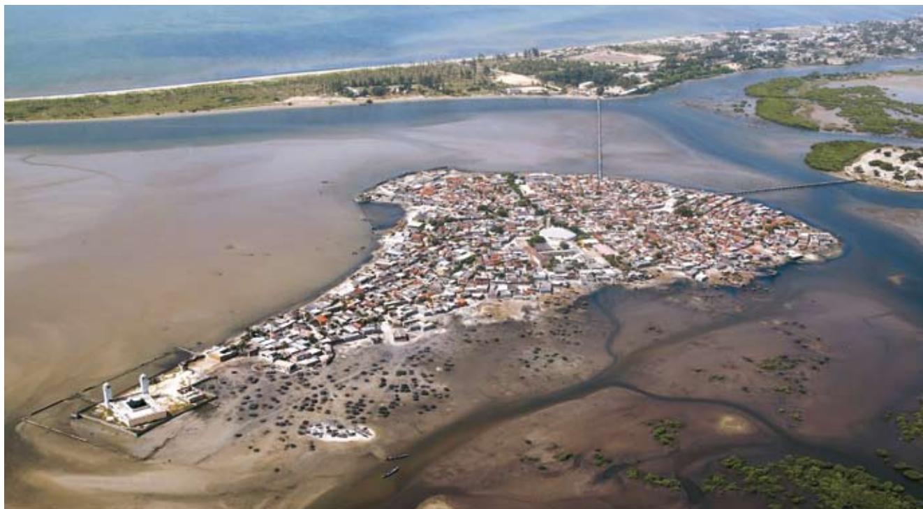
Fadiouth lies at the heart of a complex patchwork of coastal swamps and mangroves.

20. These environments provide significant ecological services to the coastal societies, in particular by limiting erosion and its impacts. Their conservation is already largely justified through the commitments of the States to maintain biological diversity, and makes a direct contribution to reducing the risks related to shoreline mobility and to strategies for adapting to climate change. The concept of natural infrastructure already mentioned at the CBD's CoP 10, and again at the recent global platform on risk reduction, leads to a renewal of the approaches to land planning, particularly in the coastal area.