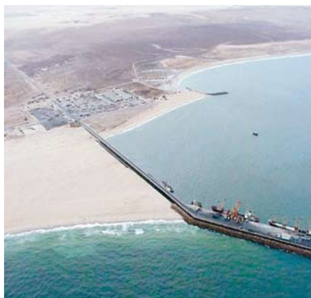
Harbour infrastructure is responsible for significant alterations in shoreline changes. Nouakchott harbour: siltation to the north and erosion to the south.

14. The full set of results has been summarised in three mapping systems rendered at 1:500,000 (9 X A1 format sheets for each topic) covering coastal geodynamics, the human stakes and the management scheme respectively.