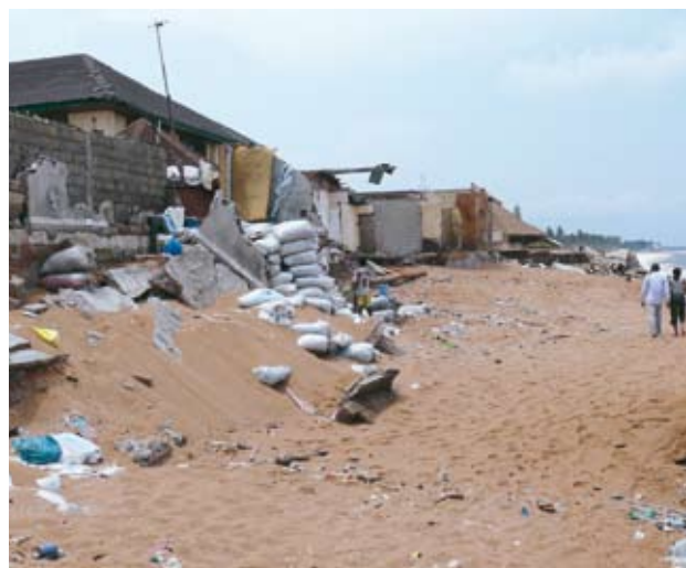
Effondrement d'habitations et tentatives de protection individuelle.

4. The West African coast generally consists of more or less ancient sediment deposits, making it particularly vulnerable to various factors in the marine environment and atmosphere (waves, currents, winds and tides) that influence shoreline change. The role of inland waters in episodes of heavy rainfall and floods should also be taken into account.