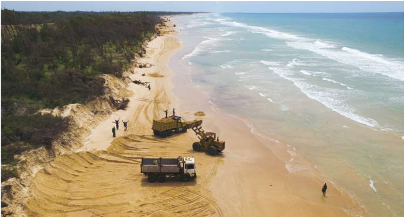
Extraction of sand to the north of the Cape Verde peninsula (Senegal)