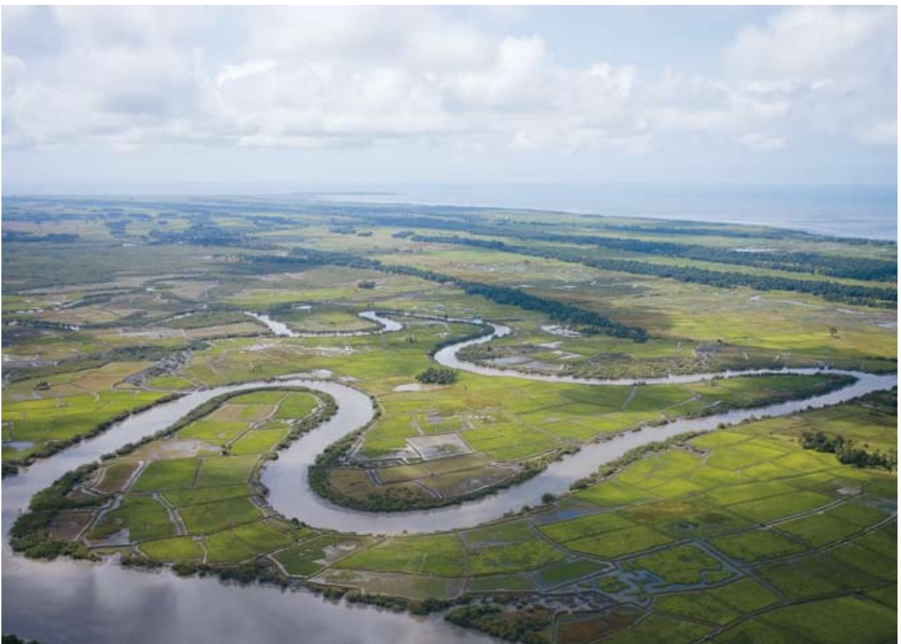
Mangrove rice cultivation systems are at risk, even under the hypothesis of a moderate rise in sea level.